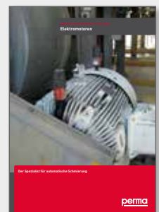
Electric motor lubrication (please refer to flyer)