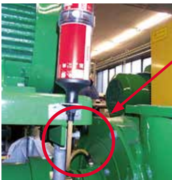
Gland lubrication (1 point)