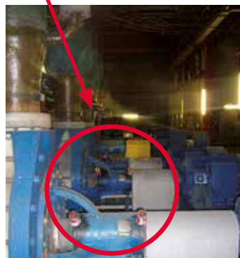
Bearing lubrication (2 points)