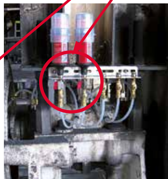
Labyrinth lubrication (2 points)