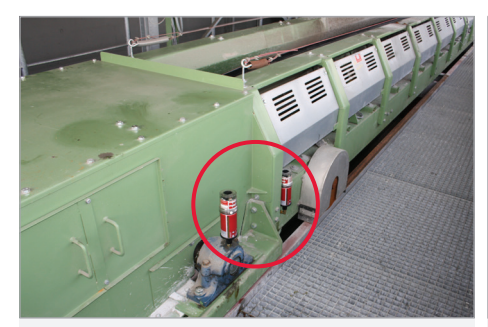
Lubrication of pillow block bearing on a conveyor