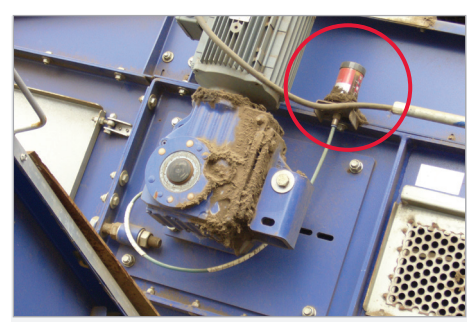
Lubrication of flange bearing on a conveyor