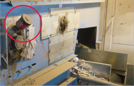
Lubrication of flange bearing on a conveyor