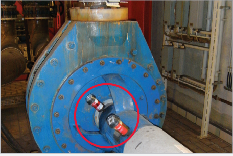
Lubrication of drive shaft on a pump