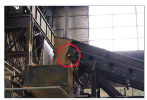
Lubrication of pillow block bearing on a conveyor