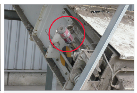
Lubrication of flange bearing