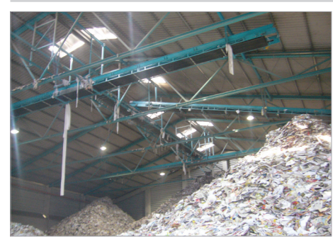
→ Harsh ambient conditions (dust, dirt and vibrations)