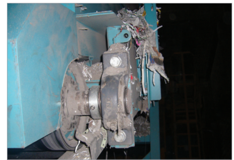
→ Hard-to-reach and dangerous lubrication points