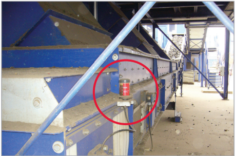
Lubrication of pillow block bearing on a conveyor